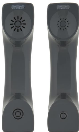
Figure 1. Cisco Unified Wideband and Narrowband Handsets

The new Cisco Unified Wideband Handset (left) looks similar to the Cisco Unified Narrowband Handset (right) (Figure 1).